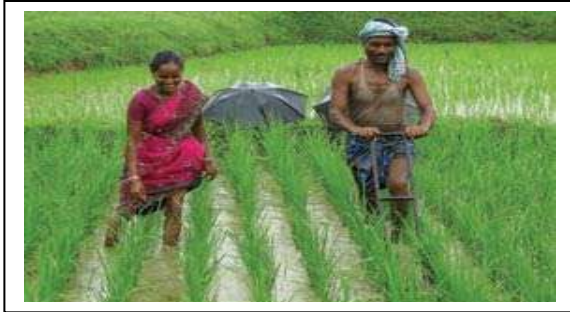
SRI Model of Paddy cultivation

Corresponding to the awareness program on rural technology a number of farmers clubs are formed to bring the technology into action. The farmer clubs are formed as per the guideline of NABARD and various demonstrations conducted through the farmers club are as follows: